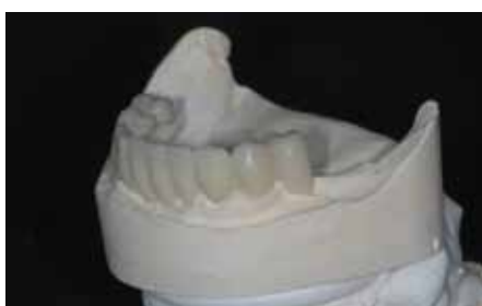
Fig. 5: A wax-up was made preoperatively and transferred to a temporary dish.