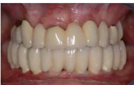
Fig. 30: Intraoral diagnosis after integrating the final restoration.