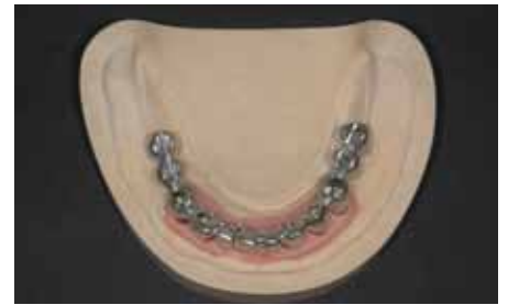
Fig. 24: Scaffold after casting and elaboration.

The scaffold was modeled with burn-out plastic copings, modeling plastic and wax. To avoid tensions in the modeling, separations and new joining together were made using pattern resin. A special embedding procedure enabled casting to be tension-free. The scaffold was checked on the model and in the mouth using the Sheffield test.