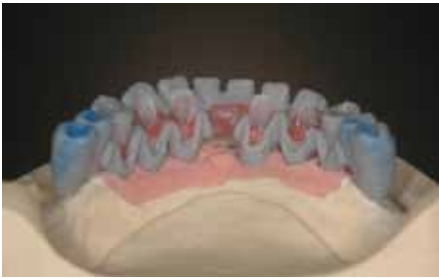
Fig. 22: Scaffold modeling.