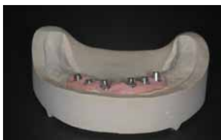
Fig. 20: CAMLOG® Vario SR straight abutments on the model.