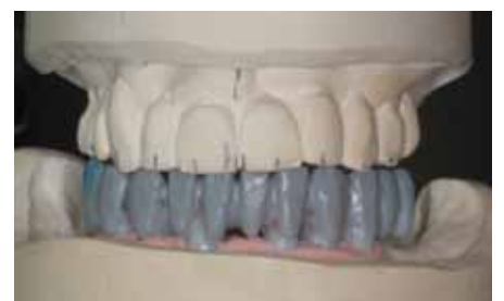
Fig. 21: Scaffold modeling.