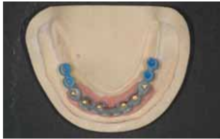
Fig. 23: Scaffold modeling.