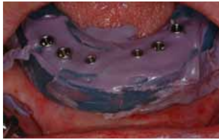
Fig. 11: Open impression using polyether – (Impregum®). The prosthetic interim restoration was performed directly postoperatively.