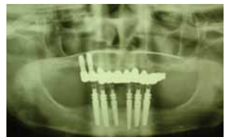
Fig. 18: Due to the firm peri-implant soft tissue, a control OPG was taken after inserting the impression posts for open tray impression.