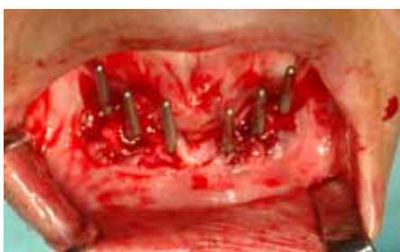
Fig. 7: Six CAMLOG® SCREW-LINE Promote® implants were placed interforaminally. Check on implant position using parallelizing abutments. Cylindrical gingiva formers were integrated intraoperatively, then the wound was sealed.