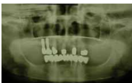
Fig. 4: OPG initial findings; moderate atrophy of the mandible, the remaining teeth in the mandible exhibit horizontal and vertical bone cavities.