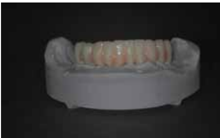
Fig. 13: During preparation of the long-term temporary bridge 35–45, the tooth positions were taken from a wax-up which had been created in advance.