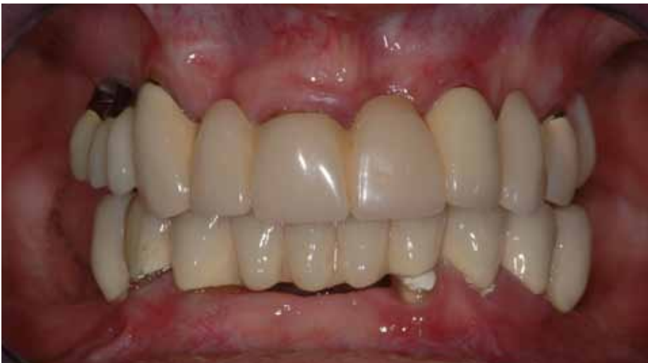
Fig. 33: Initial diagnosis.