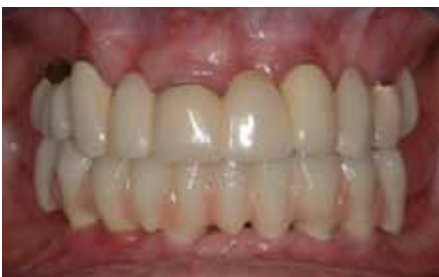
Fig. 16: Long-term temporary denture 16 weeks postoperatively.