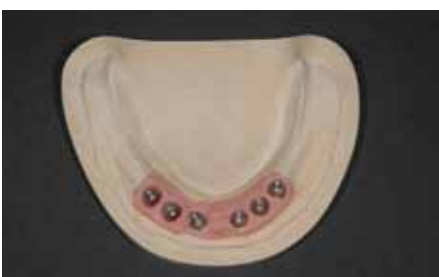
Fig. 19: CAMLOG® Vario SR straight abutments on the model.