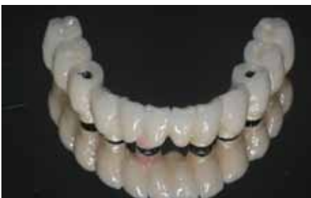
Fig. 27: Final screw-retained prosthesis after ceramic veneering.