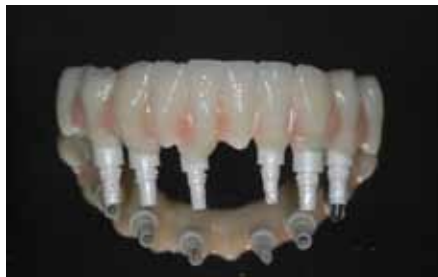
Fig. 14: Long-term temporary denture on PEEK abutments. A key aspect is the restoration's accuracy of fit which was checked clinically using the Sheffield test during insertion.