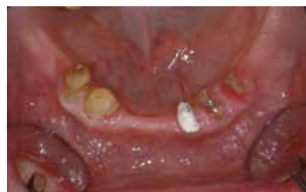
Fig. 3: State after removal of the bridge. Caries-destroyed residual teeth in the mandible, not worth being preserved.