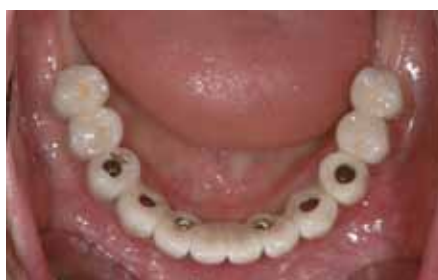
Fig. 31: Final restoration before closing the screw channels.