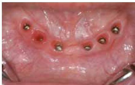
Fig. 17: Soft tissue situation after removing the long-term temporary denture at 16 weeks postoperatively. A mucositis was detected in region 43 and treated locally. Otherwise, stable soft tissue conditions.