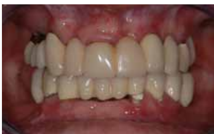
Fig. 1: Initial situation with recurrent loosening of the circular metal-ceramic bridge in the mandible.