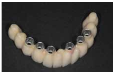
Fig. 28: Basal view of the final screw-retained prosthesis after ceramic veneering.