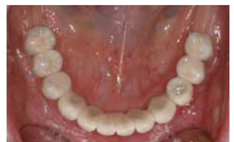
Fig. 32: Final restoration after closing the screw channels.