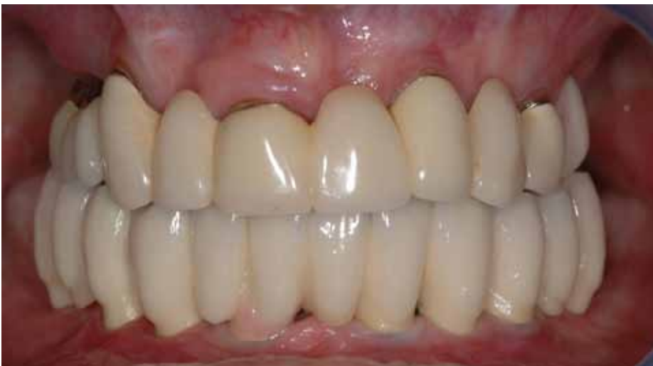
Fig. 35: Intraoral diagnosis after integrating the final restoration.