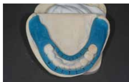
Fig. 6: Markings were made on a prepared open impression tray for use as a drilling orientation template.