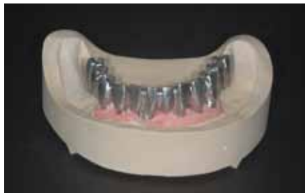
Fig. 25: Scaffold.

The scaffold was modeled with burn-out plastic copings, modeling plastic and wax. To avoid tensions in the modeling, separations and new joining together were made using pattern resin. A special embedding procedure enabled casting to be tension-free. The scaffold was checked on the model and in the mouth using the Sheffield test.