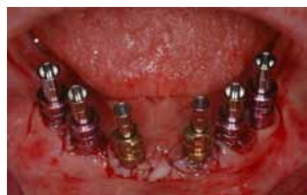
Fig. 9: Postoperatively inserted open-tray impression posts.