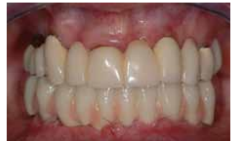
Fig. 15: Long-term temporary denture 1 week postoperatively. Status before suture removal, moderate soft tissue edema.