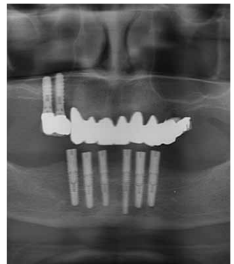
Fig. 36: OPG after implantation in the mandible.