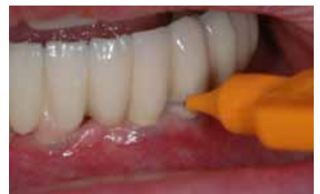
Fig. 29: After veneering, the restoration was tried in, checked for the ability to maintain hygiene and integrated definitively.