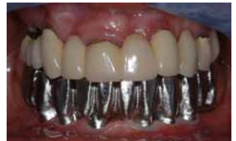
Fig. 26: The scaffold was checked in the mouth using the Sheffield test.