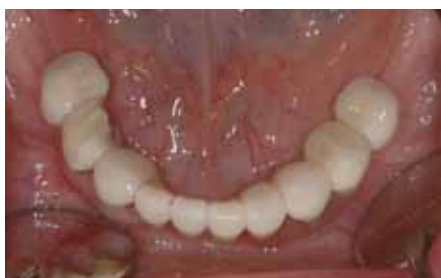
Fig. 2: Insufficient bridge in the mandible.