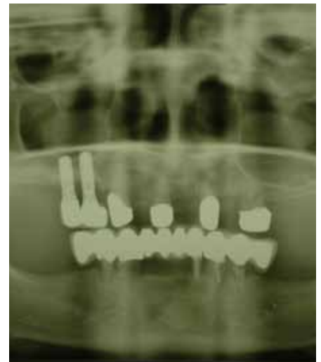
Fig. 34: OPG initial diagnosis.