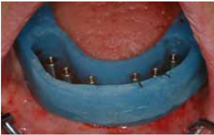
Fig. 10: Checking the open impression tray.